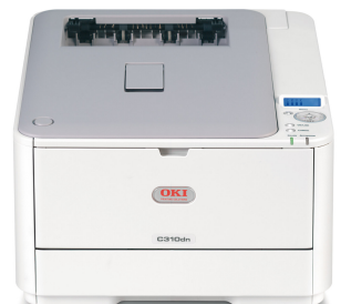
C310dn duplex, networked